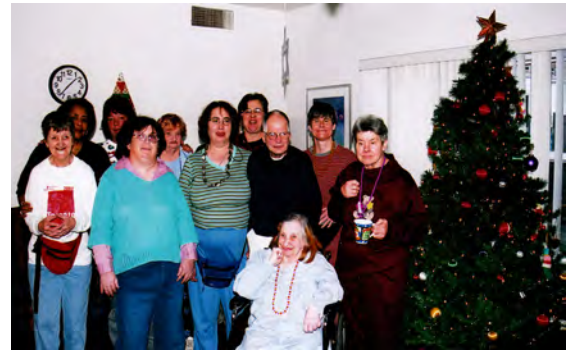
Residents at SHORE Homes West celebrating the holidays during an Open House in December 2005.