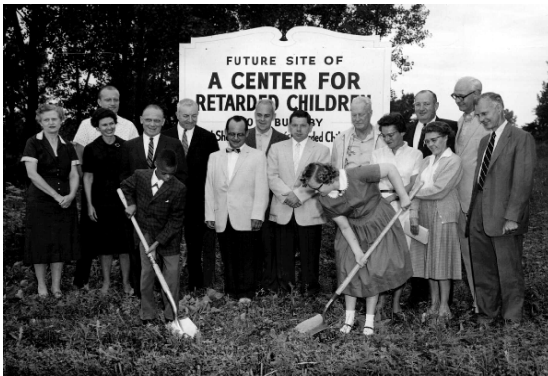
Groundbreaking for the future SHORE School at 2525 Church Street in Evanston on August 5, 1961.