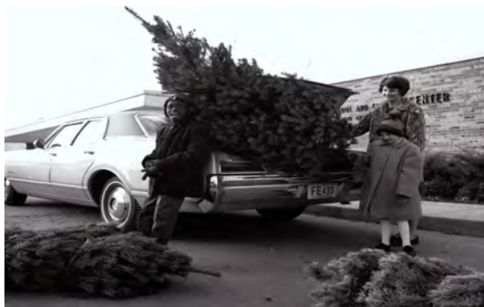
Christmas trees were sold at SHORE School for decades, which became a family tradition for many living in the north shore area.